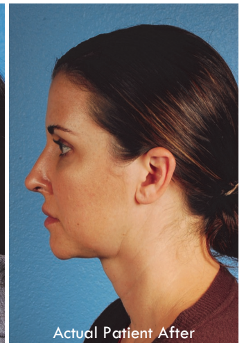
Actual Patient After

every rhinoplasty surgery is the same, so it is important to have your surgery performed by someone who specializes in both cosmetic surgery and functional nasal surgery.